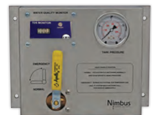
Remote bypass box option