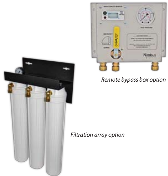
Remote bypass box option

Based on membrane performance with softened water at 77°F, 500ppm TDS, 120 psig, <3 grains hardness and 80% recovery. Membrane performance may vary ±15%.